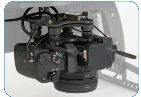
Fixed Sony Alpha a6000 Camera Mount