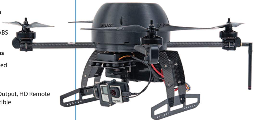
Leptron RDASS Precision with optional Stabilized Single-Camera setup using a GoPro Hero4 camera