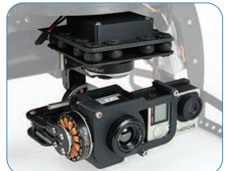
Stabilized Dual-Camera Gimbal