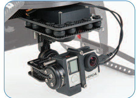
Stabilized Single-Camera Gimbal with GoPro Hero4 Black

The MicaSense RedEdge™ is an advanced, lightweight, multispectral camera optimized for use on small unmanned aircraft systems. RedEdge™ provides accurate multi-band data for agricultural remote sensing applications.