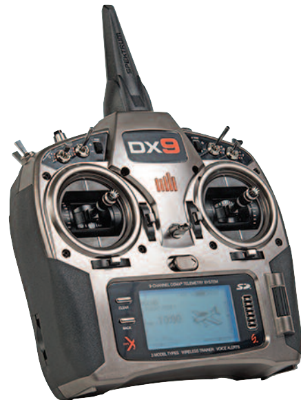
RDASS Precision Controller