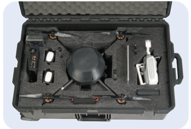
Leptron RDASS HD2 Kit with iPad