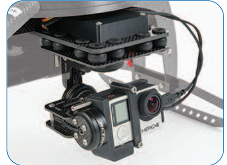
Stabilized Single-Camera Gimbal with GoPro Hero4 Black

The MicaSense RedEdge™ is an advanced, lightweight, multispectral camera optimized for use on small unmanned aircraft systems. RedEdge™ provides accurate multi-band data for agricultural remote sensing applications.