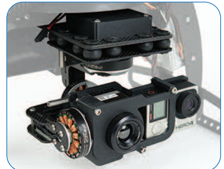
Stabilized Dual-Camera Gimbal