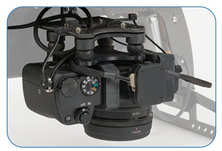
Sony Alpha a6000 with Gimbal