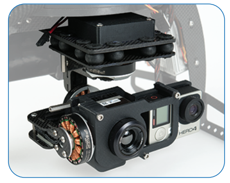
GoPro and FLIR Vue Pro with Stabilized Gimbal