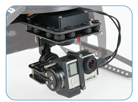
Stabilized Gimbal with GoPro Hero4 Black

The MicaSense RedEdge is an advanced, lightweight, multispectral camera optimized for use on small unmanned aircraft systems. RedEdge provides accurate multi-band data for agricultural remote sensing applications.