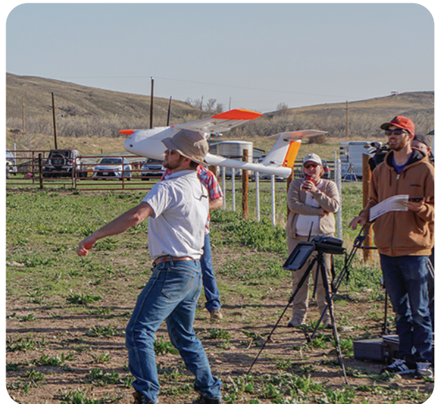
Available Flight Training